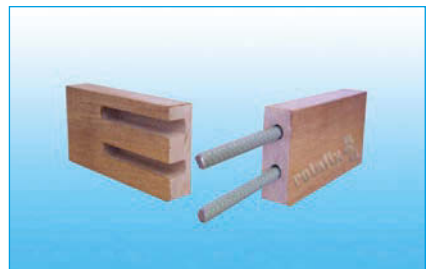
Side slot and rod ready for RSA thixotropic adhesive