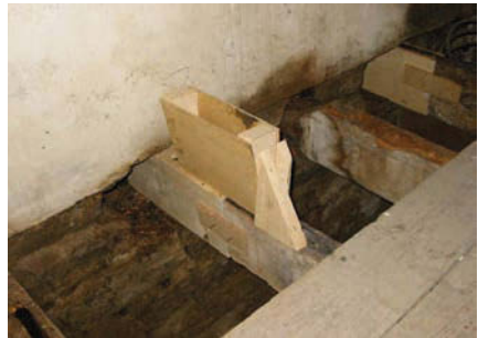
Fig. 6 Header box to assist pouring of TG6

P8 Bonding Paste was used to seal the joint between the new and the existing timbers as a temporary measure to prevent the TG6 leaking between the joint.