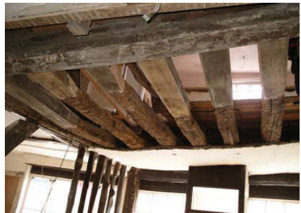
Fig. 6 Underside of the repaired beam prior to being contoured

After approximately 24 hours the props were removed. The new timbers were then contoured, shaped, coloured and made to be visually compatible with the original beams.