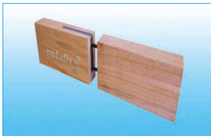
Rods and top slot with TG6 Structural Grout