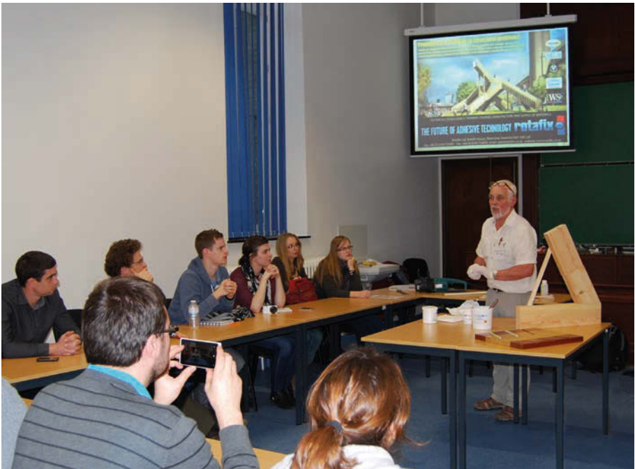
A training session provided by Rotafix for European engineering graduates at Mons University, Belgium.

Our head office can be contacted by telephone on +44(0)1639 730481 or by fax on +44(0)1639 730858. Alternatively, you can send an email to sales@rotafix.co.uk