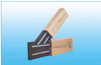
TG6 restored end

The diagrams below show typical examples of Timber Resin Splice units.