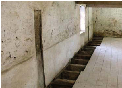
Fig. 2 Sufficient floor boards removed for access

In this example we used a Rotafix TRS ® with metallic rods bonded to the original timber with TG6 Structural Grout. A drill and appropriate diameter bit was used to form the continuous vertical slot in the timber.