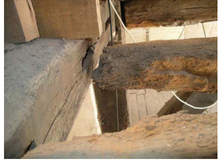
Fig. 1 Detached floor joists

Given the historical importance of the building and the Grade 2 listing it was necessary to effect a repair that retained as much of the original timber as possible.