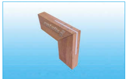
Moment Resistant Joint RSA and GFRP