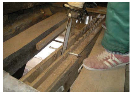
Fig. 3 Slots being cut with a jig and modified chainsaw

Slots were cut into the timber using a specially modified Rotafix chainsaw and a jig to ensure that the slots were straight and of consistent depth Fig. 3