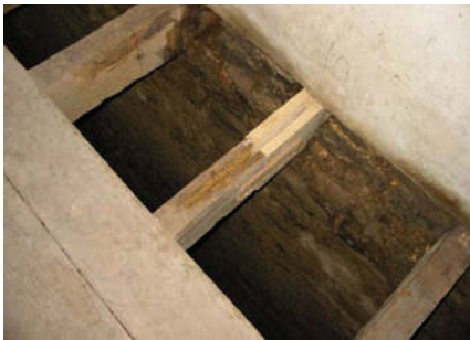
Fig. 5 TRS ® unit fitted in place