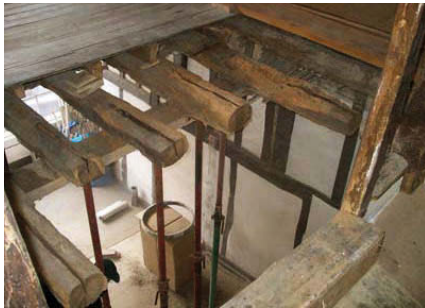
Fig. 2 Propped floor joists with decay removed

Slots were cut into the timber using a specially modified Rotafix chainsaw and a jig to ensure that the slots were straight and of consistent depth Fig. 3