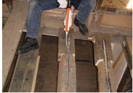
Fig. 4 RSA being injected

The next step was to replace the damaged ends with new ends that had been fabricated off site. Each new end was made to measure. It was important to species and moisture match the timber where possible to ensure that any expansion or contraction was consistent in both the new and existing timbers.