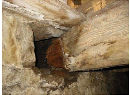
Fig. 1 Decayed floor joint in wall pocket

As can be seen in Fig. 1 , the floor joists had decayed in the wall pocket, more than likely as a result of damp ingress in the stone walls. The joists had an internal span of approximately 5 metres. The species of the wood is thought to be Baltic pine softwood ( pinus sylvestris ).