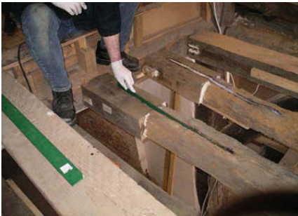
Fig. 5 Carbon Fibre Reinforced Plate being inserted to check length

Fig. 4 above shows the slots being carefully injected with RSA. The Carbon Fibre Reinforced Plate (CFRP) was then inserted centrally into the RSA as in Fig. 5