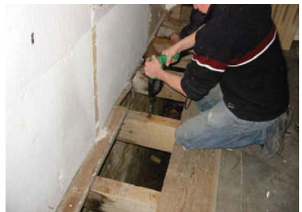
Fig. 3 Slots being drilled into the original floor joists

By using the Timber Resin Splice (TRS ® ) it was possible to replace the ends of these beams without disturbing the majority of the floor as would be necessary if we were to completely replace the joists. This is one of the biggest advantages of the TRS ® method.