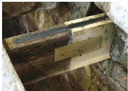
Fig. 7 TG6 Filled TRS Unit

It was important to ensure that the pocket was completely filled with the TG6 as can be seen in Fig. 7